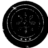
FERDINAND ROMUALDEZ MARCOS JR. President of the Philippines