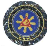
RODRIGO ROA DUTERTE President of the Philippines