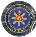
RODRIGO ROA DUTERTE President of the Philippines