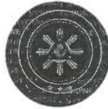
RODRIGO ROA DUTERTE President of the Philippines