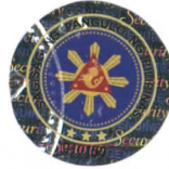
RODRIGO ROA DUTERTE President of the Philippines