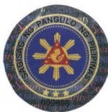
RODRIGO ROA DUTERTE President of the Philippines