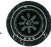
RODRIGO ROA DUTERTE President of the Philippines